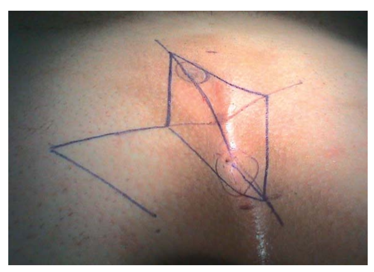
Figure 5: Diagram of the incision in a modified Limberg flap. The lower pole of the rhomboid excision lies lateral to the natal cleft, so that the resulting wound will also lie lateral to the midline.

Despite the existence of an S3 guideline, there are still no generally accepted treatment algorithms. Excision with open treatment is currently the most common form of treatment, but the use of minimally invasive techniques, endoscopy, and laser surgery is increasing.