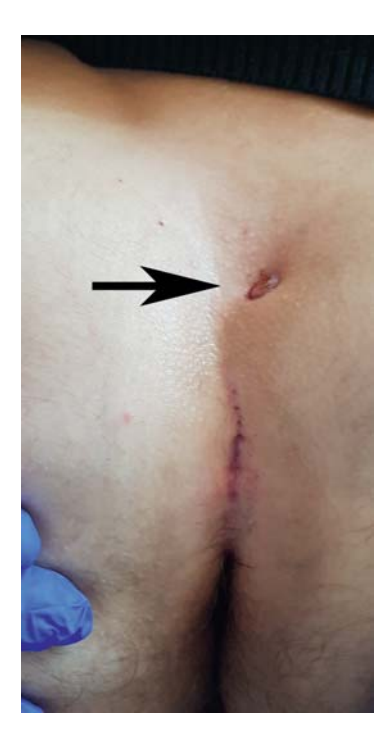
Figure 1: Chronic pilonidal disease. The openings in the natal cleft, so-called pits, correspond to the destroyed hair follicles. The fistulous openings outside the natal cleft (arrow) have no conventional definition; in this article, they are called secondary lesions.