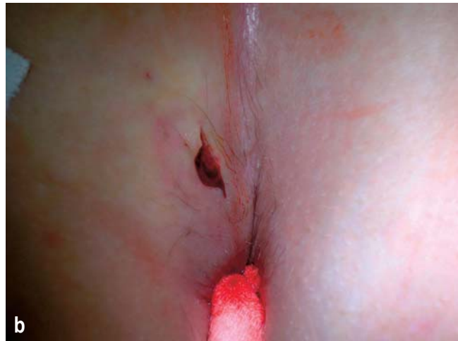
Figure 2: a) A pilonidal abscess; b) the same pilonidal abscess after incision under local anesthesia. Incision can almost always be performed under local anesthesia.